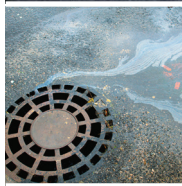
Chemicals: motor oil, paint